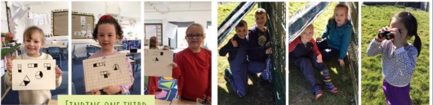
FINDING ONE THIRD