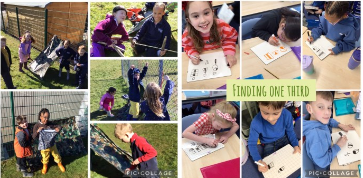
FINDING ONE THIRD